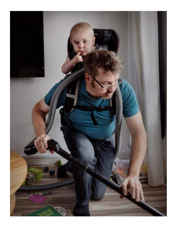
Swedish Dads