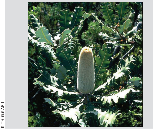
Banksia solandri, Stirling Range Banksia. The species name commemorates Daniel Solander. It was first gathered in 1829 in the Stirling Range WA by William Baxter. (The Banksia Book, AS George, p 80)

During the voyage Solander and Banks collected around 17,000 plant specimens. The specimens from Australia included around 900 species and in New Zealand 349 species. Solander was the author of the first individual floras of Australia and New Zealand. These were major but unpublished botanical works. His pioneering descriptions have